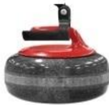
Off the hosel - Asham