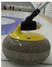
Off the hosel - Sure Shot