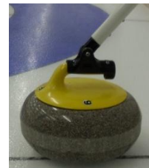
Off the end, lift-off - Olson/Excalibur